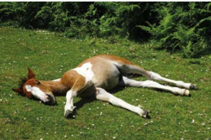
Dartmoor Hill Pony foal on a very hot day!