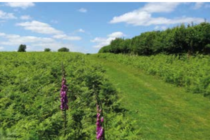
Grassy crisscross through the bracken on West Down