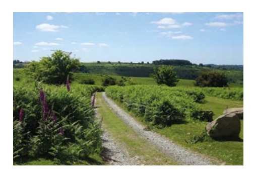
The track heads across West Down