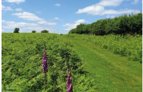
Grassy crisscross through the bracken on West Down