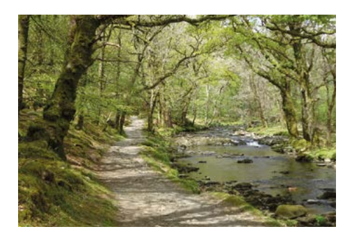
The riverside path in springtime