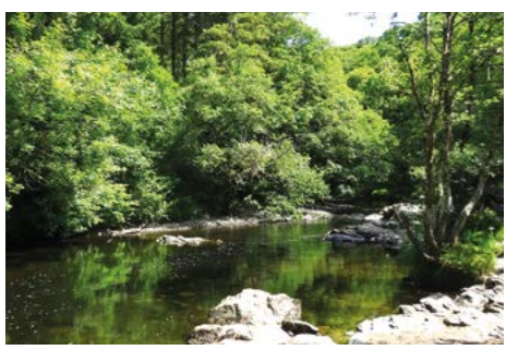
The River Tavy at Double Waters