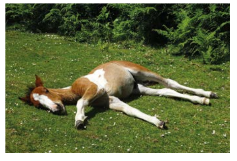
Dartmoor Hill Pony foal on a very hot day!