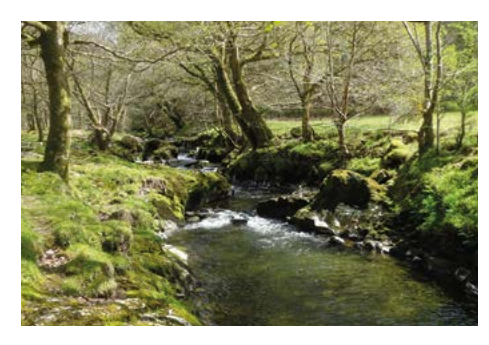
The Walkham is a delightful river