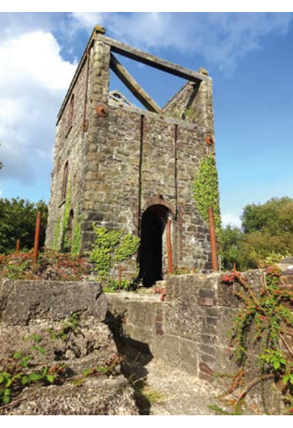
Hingston Down Mine engine house