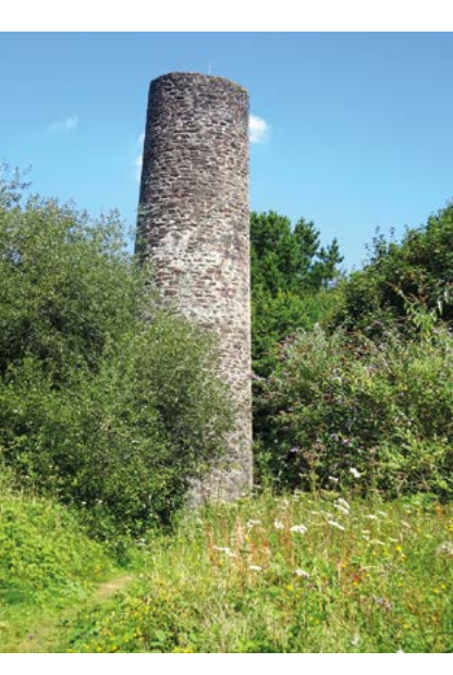
Chimney, Drakewalls Mine