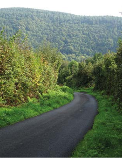
Stony Lane: a steep descent into the valley