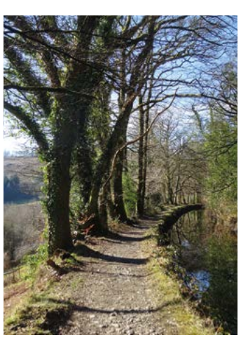
The impressive Shillamill Viaduct