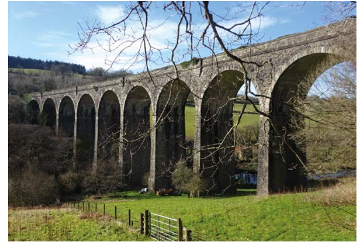
The canal's only lock (reverse view) Trail all along the canal