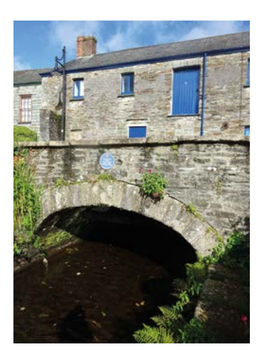
Tavistock Canal wharf, with the old granary beyond the bridge (above the canal)