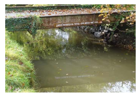
Keep any eye out for the Poetry Trail all along the canal