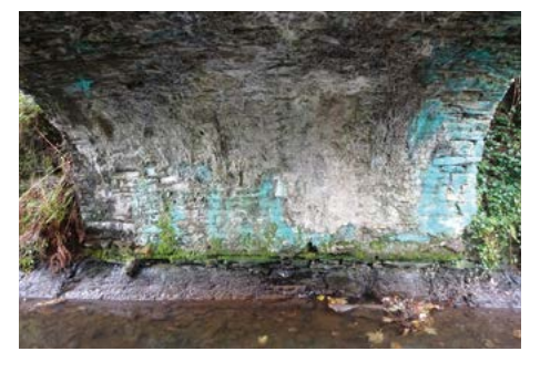
Copper staining under Crowndale Bridge