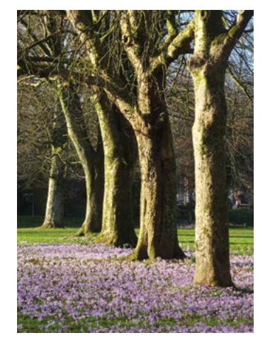
Crocus carpet in The Meadows in early spring