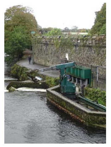
The take-off point for the canal is just below Abbey Bridge