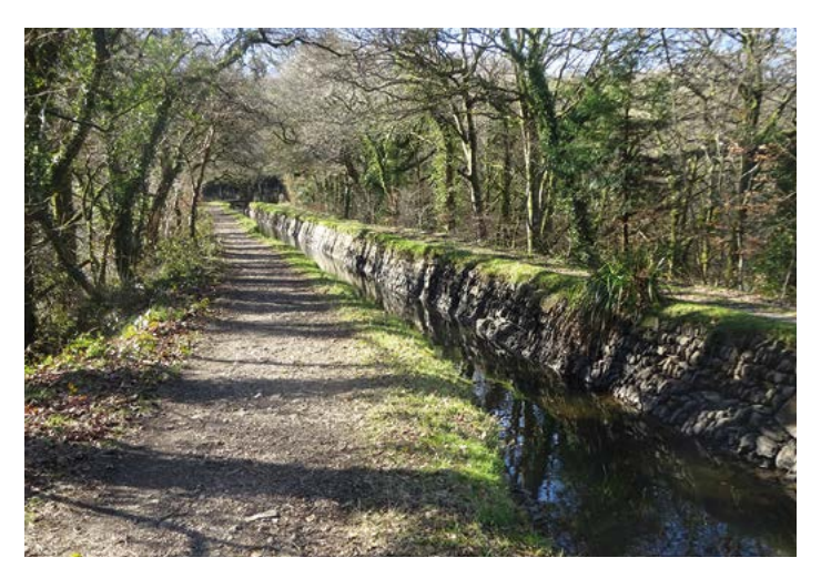
An aqueduct carries the canal across the valley of the River Lumburn