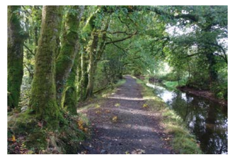
The Tavistock Canal: a peaceful, easy walk all year round