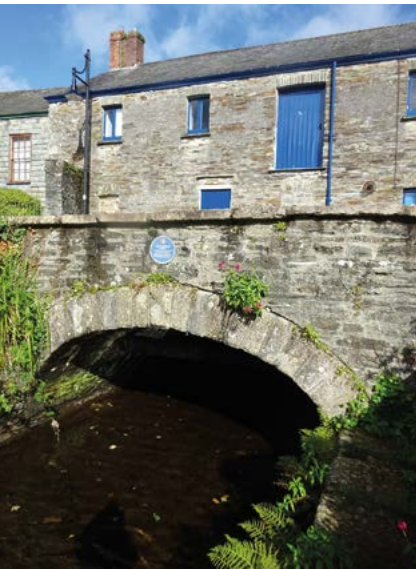
Tavistock Canal wharf, with the old granary beyond the bridge (above the canal)