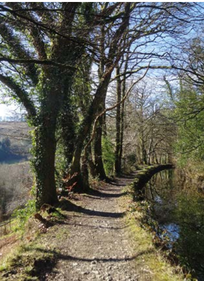
The impressive Shillamill Viaduct