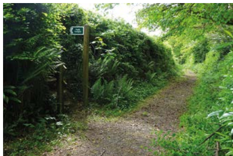
The footpath crosses a track near Rumleigh