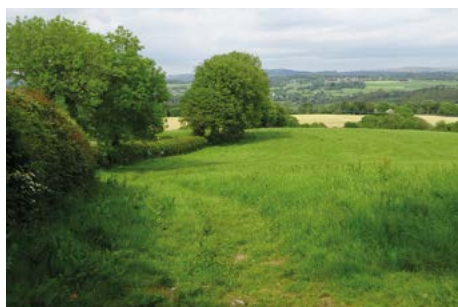
Looking back towards the Tavy valley on Point 7