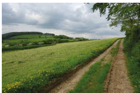
Lovely field-edge path on Point 6