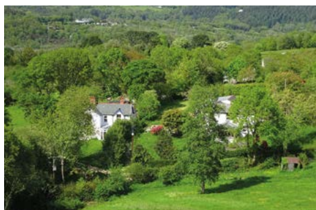
View across old market garden fields towards the Tamar Valley

Keep straight on to meet a track on a bend; keep ahead again, passing houses, eventually turning sharp right to find the station, which opened in 1890 and was important for the onward transport of local market garden produce into the early 20th century.