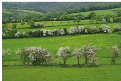
Hawthorn hedgerows at Slymeford