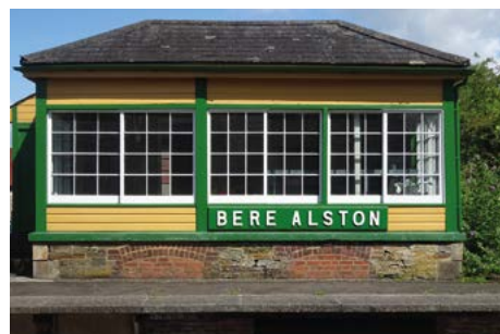
The old signal box at Bere Alston Station