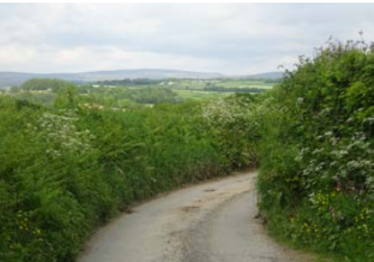
Flower-filled hedgebanks and distant views of Dartmoor