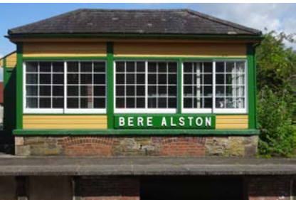
The old signal box at Bere Alston Station