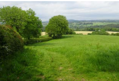
Looking back towards the Tavy valley on Point 7