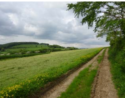
Lovely field-edge path on Point 6