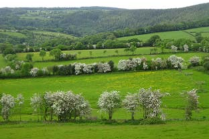
Hawthorn hedgerows at Slymeford