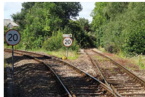
The two railway tracks at Bere Alston Station: Plymouth left, Calstock (and Gunnislake) right