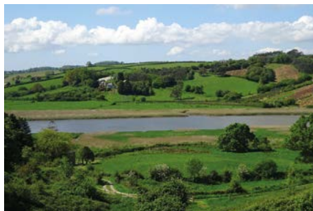
View across the river from the track leading to Ward Mine and South Ward Farm