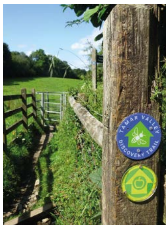
The Tamar Valley Discovery Trail is followed for two thirds of the route

7. Footpath back to station (SX 433 673). Just before the lane starts to ascend again turn left through a metal gate (footpath sign on a telegraph post on the right of the lane). Follow the field-edge path ahead to pass under the railway line (Gunnislake line) and through a gate into a field, to find a path junction. Keep straight on across the field, aiming for a couple of houses – the telecommunications mast on North Hessary Tor at Princetown on Dartmoor can be seen in the far distance – and pass through a kissing gate on the far side (re-joining the TVDT) onto a track. Turn right; pass under two railway bridges (the line to Gunnislake, and then Plymouth), then turn left to find the station.