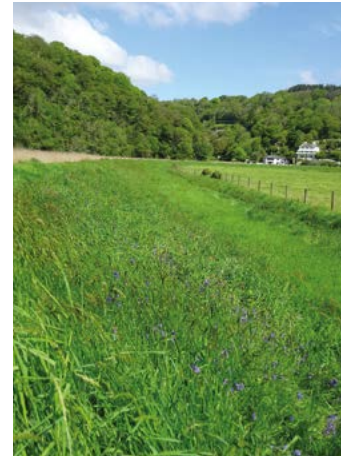
Looking back along the embankment path