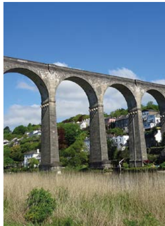
The lofty Calstock Viaduct