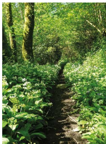
The path through Buttspill Wood in May