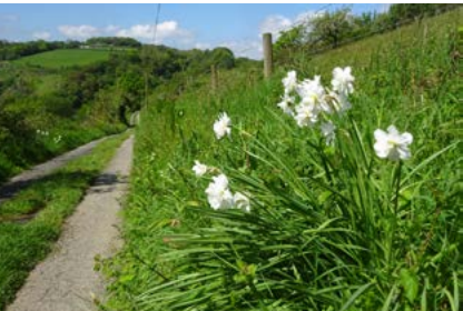
Tamar Double White daffodils in the hedgebank