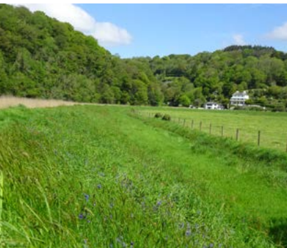
Looking back along the embankment path