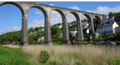
The lofty Calstock Viaduct