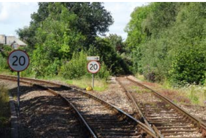
The two railway tracks at Bere Alston Station: Plymouth left, Calstock (and Gunnislake) right