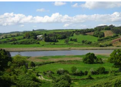
View across the river from the track leading to Ward Mine and South Ward Farm