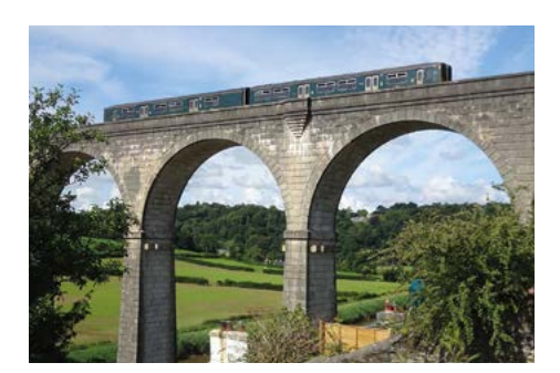
The Tamar Valley Line in action!

Keep straight on through the woodland, descending into the Danescombe valley; turn right to return to Calstock. On reaching Commercial Road turn sharp left back to the station.