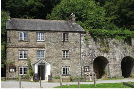
The Edgcumbe and limekilns on Cotehele Quay