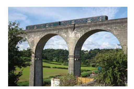
The Tamar Valley Line in action!