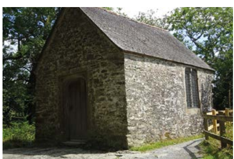
'The Chapel in the Woods'