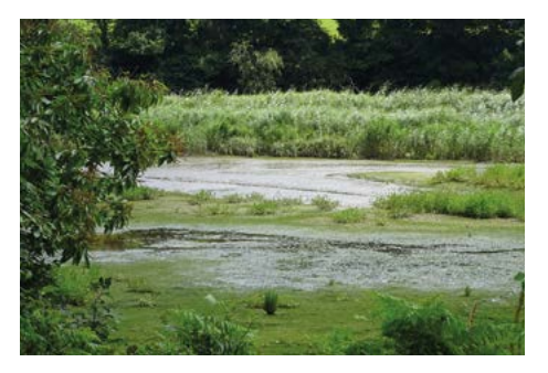
Newly created intertidal marsh on the Calstock estate