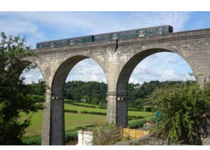
The Tamar Valley Line in action!