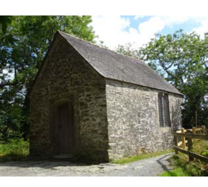
'The Chapel in the Woods'