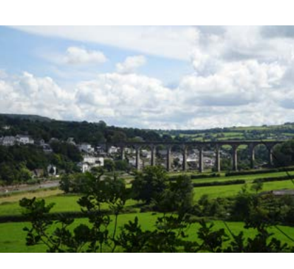
Calstock and the viaduct from the viewpoint in Cotehele Wood