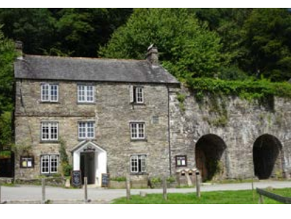
The Edgcumbe and limekilns on Cotehele Quay