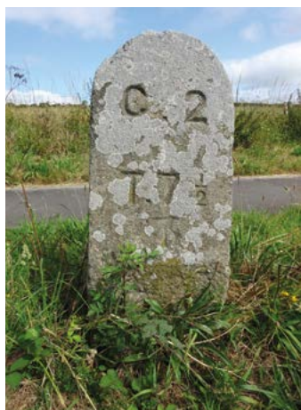
The Callington Turnpike Trust installed the milestones seen along the A390 – originally a turnpike road