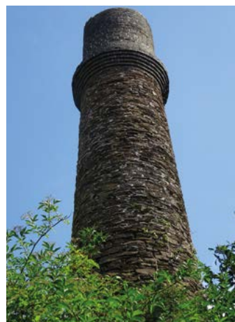
Chimney at the Prince of Wales Mine, overlooking the public footpath