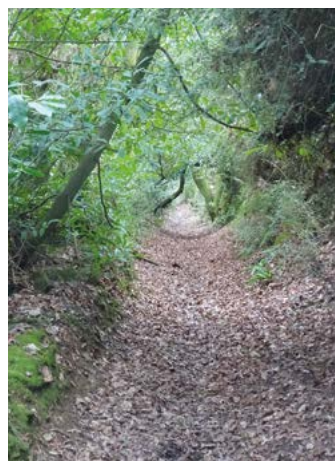
A lovely enclosed path heads down to Harrowbarrow