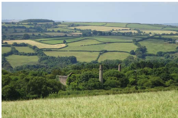
Beautiful view across the fields to the remains of the Prince of Wales Mine