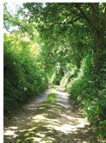
The track leading to Wheal Brothers in summertime