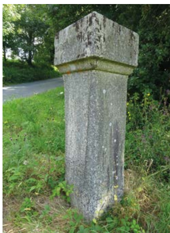
Three-cornered direction stone, dating from the 18th century

Cross with care, then turn left along the cycle track to return to the start point.