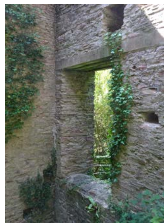
Watson's Shaft pumping engine house