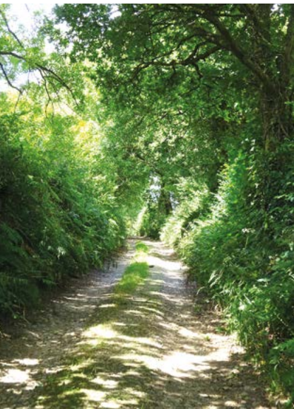
The track leading to Wheal Brothers in summertime