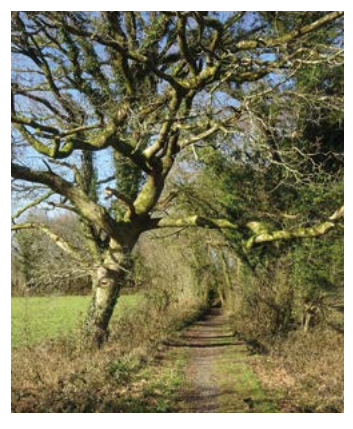
The path follows an old mineral railway line which linked Devon Great Consols to Morwellham on the River Tamar (reverse view)

7 SX 438720 Turn right, steeply uphill; the track curves sharp right; a few paces on, at a fork, keep left, uphill, to join the outward route. Turn left and retrace your steps to the car park.