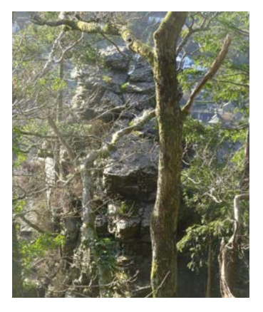
Chimney Rock – hard to see at most times of the year!