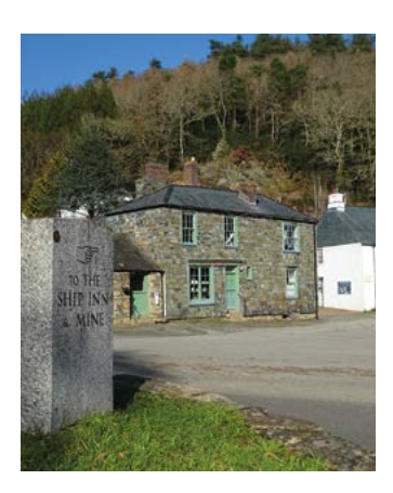
Morwellham Quay: a peaceful place out of season today.