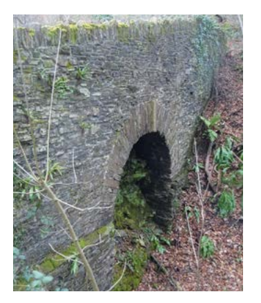
The path skirts the old railway bridge en route to Hatch Wood