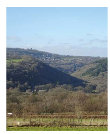
A lovely view up the wooded Tamar Valley in early spring