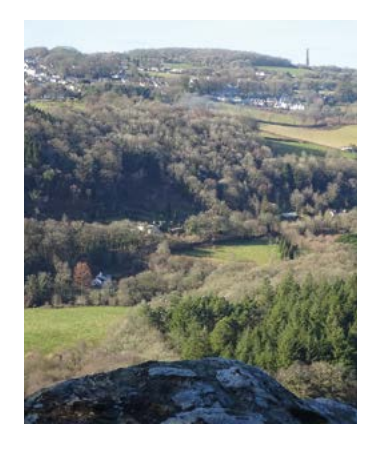
View across the valley – and into Cornwall – from Morwell Rocks