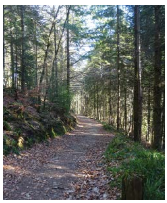
The old mineral line provides an easy walk across the wooded valley slopes