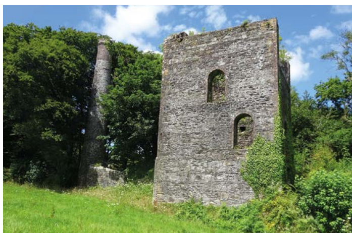
Chimney and winding engine house, Holmbush Mine: remnants of a once-flourishing industry