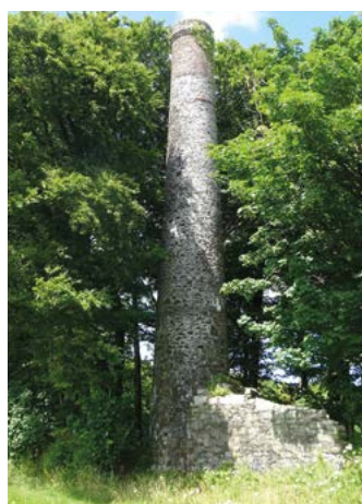
Chimney, Holmbush Mine