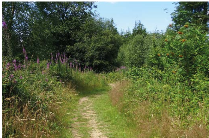
The route passes through a mix of woodland and more open areas, particularly attractive in the summer months