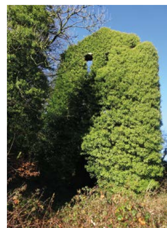
Ivy-covered remains of Hitchen's pumping engine house