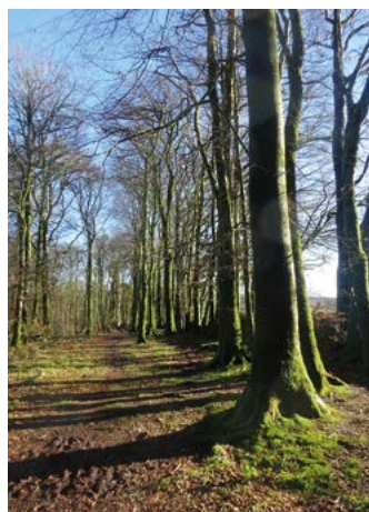
Soaring beech trees mark the southern boundary