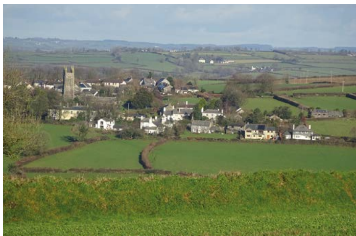
The village of Stoke Climsland, seen from the northern edge of Holmbush Wood