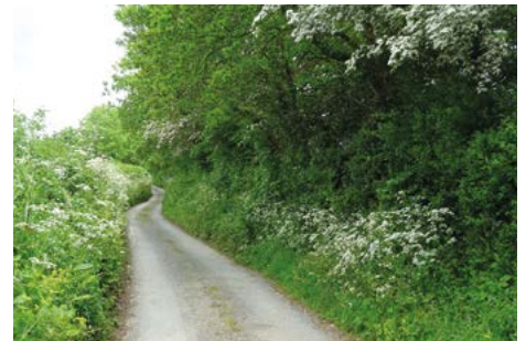
Hawthorn and cow parsley on the lane to Lopwell Dam