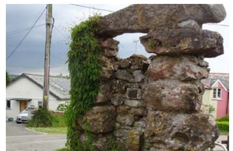
Bere Ferrers' impressive town well