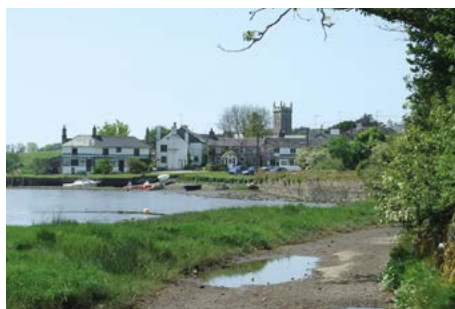
Bere Ferrers hoves into view