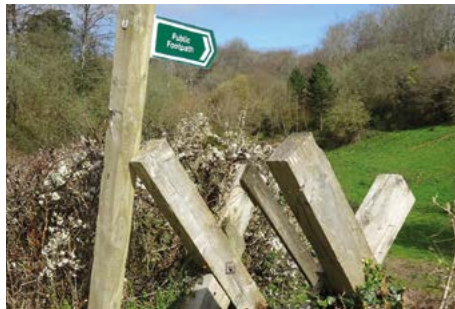
A ladder stile crosses the hedgebank at the start of Point 2