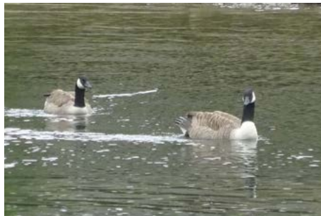
Canada geese at Lopwell Dam