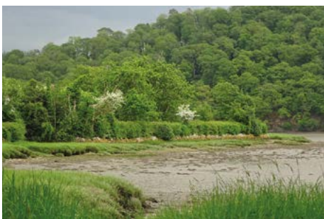
View across the estuary from Gnatham