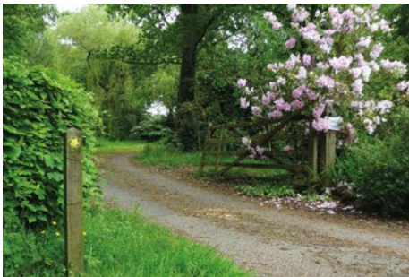
Head down the drive towards the Coach House

6 SX 457635 Turn left along Station Road, passing St Andrew's Church Hall (built as the village school in 1896). Head steadily uphill; at the top follow the road round to the right to reach the station.