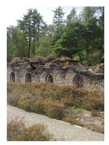
The extensive ruins of Wheal Anna Maria arsenic works