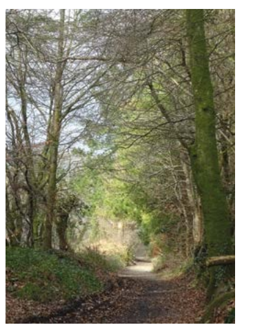
The trackbed of an old mineral railway line is followed towards the mining complex