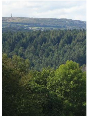
View towards Kit Hill, Hingston Down Quarries, Blanchdown Wood and the vast spoil heaps of DGC