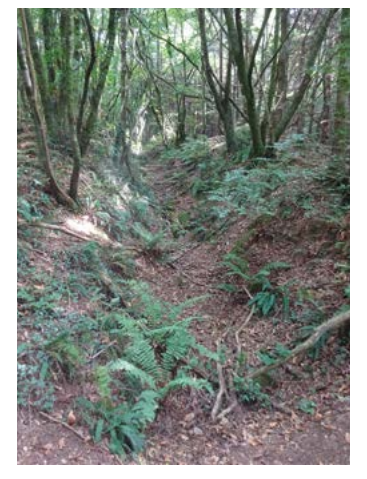
The woodland floor is peppered with trenches and workings

10 SX 433731 Turn left, soon crossing the ochre-coloured outflow of a mine drainage adit, contaminated with copper sulphate and iron oxide. Dams and settling ponds originally reduced the amount of sediment entering the Tamar, and from the 1860s up until the 1960s the stream was channelled into wooden troughs packed with scrap iron, onto which the valuable copper was deposited. Round a gate; a few steps later, at a path junction bear left, steeply uphill. Ignore paths to right and left and follow signs to Sawmill car park. Near the top of the valley side bear right at a fork to re-join the outward route and return to the car park.