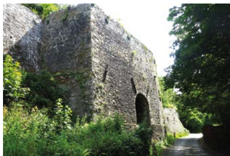
Lower Kelly limekiln below the inclined plane