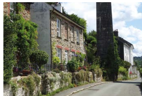
Picturesque cottage on Lower Kelly