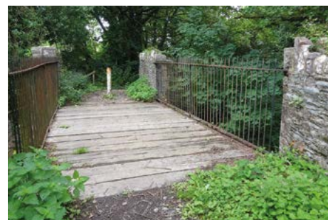
Bridge over the inclined plane