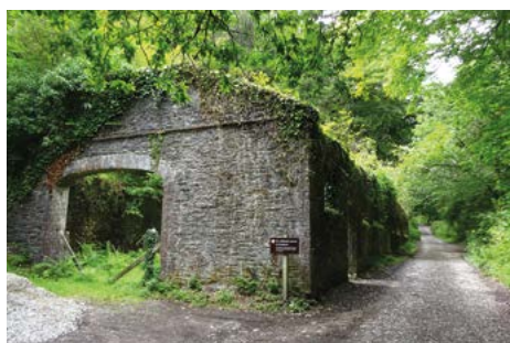
Danscombe Sawmill, active from 1878