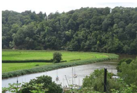
Cotehele House, seen from Higher Kelly