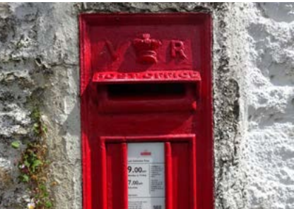
VR postbox, Lower Kelly