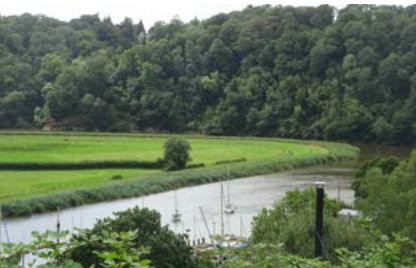
Cotehele House, seen from Higher Kelly