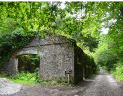
Danscombe Sawmill, active from 1878