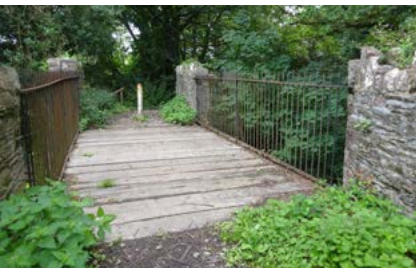
Bridge over the inclined plane