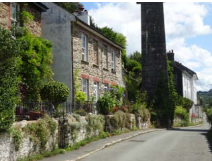
Picturesque cottage on Lower Kelly