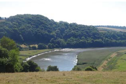
The River Tamar from East Down