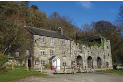
Cotehele Quay: 'The Edgcumbe', dating from the late 18th/early 19th century, with attached limekilns and warehouse