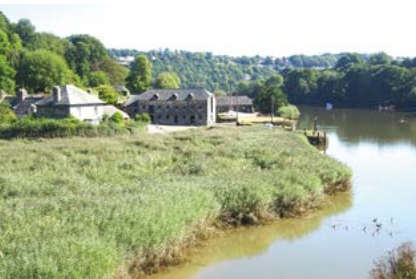
View across the Etherick Lake to Cotehele Quay