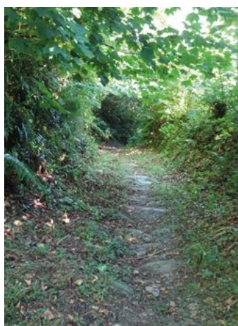
'Mill Turning': a long-established route to Cotehele Mill