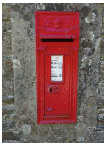
'VR' postbox in Bohetherick