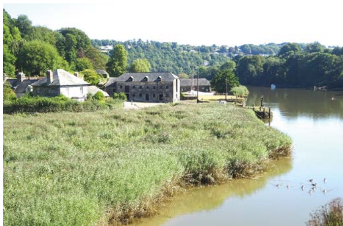
View across the Etherick Lake to Cotehele Quay