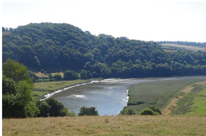
The River Tamar from East Down