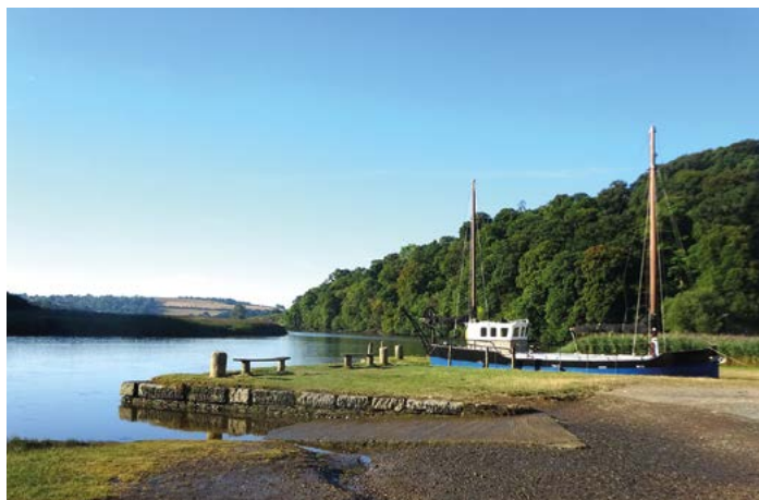
The tranquil River Tamar at Cotehele Quay on a hot summer morning