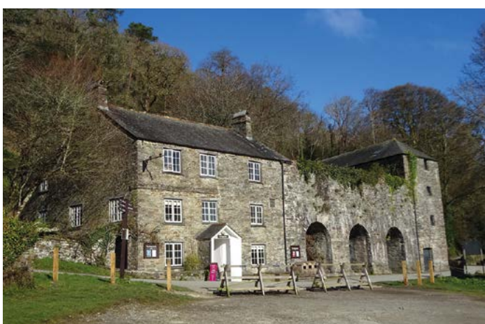
Cotehele Quay: 'The Edgcombe', dating from the late 18th/early 19th century, with attached limekilns and warehouse