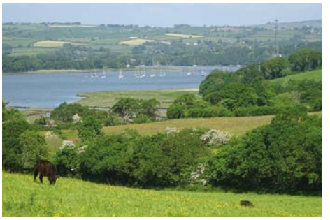
Summer hawthorn in flower, fields full of buttercups and yachts on the Tamar