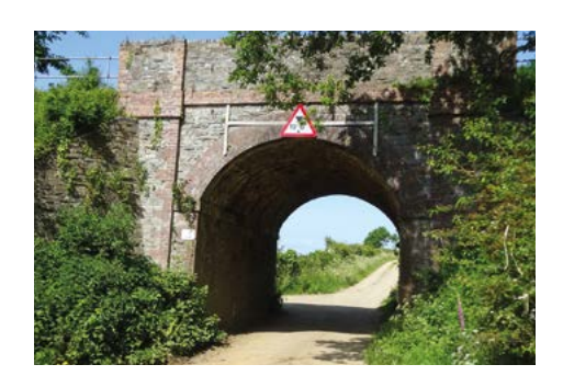
The route passes under the Tamar Valley Line railway bridge

Keep straight on to meet a track on a bend; keep ahead again, passing houses, eventually turning sharp right to find the station.