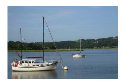
View across the Tamar at Holes Hole: Pentillie Castle on the Cornish side