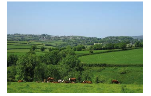
A pastoral view towards the end of Stage 6