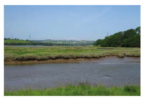
Saltmarsh at Liphill Quay