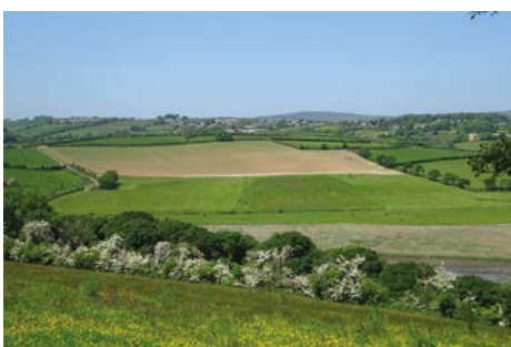
Rolling pastureland on Stage 6; Kit Hill in the distance