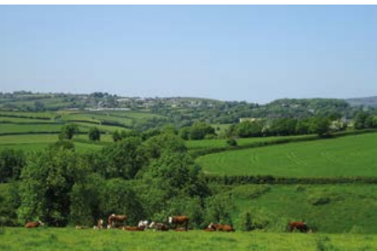
A pastoral view towards the end of Stage 6