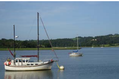
View across the Tamar at Holes Hole: Pentillie Castle on the Cornish side