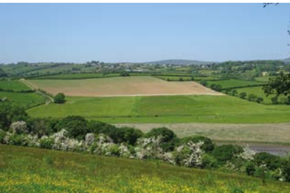
Rolling pastureland on Stage 6; Kit Hill in the distance