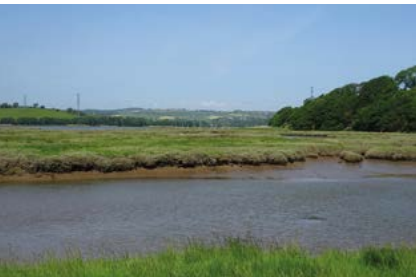
Saltmarsh at Liphill Quay