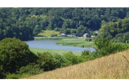
Cotehele Quay from the route of the TVDT

One of the loveliest stretches of the TVDT: looking upriver from the South Hooe peninsula towards Cotehele Quay: Cotehele House, built between 1485 and 1560, is hidden in the trees