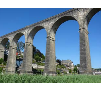
Calstock's impressive and lofty railway viaduct