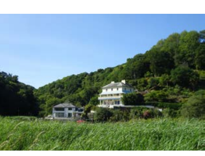
Danescombe Valley House